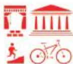
Community, Recreation, Arts & Culture